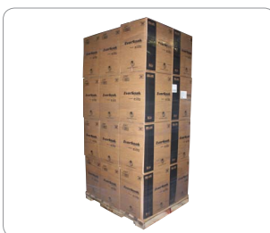
STANDARD Pads Outer Case on a Pallet