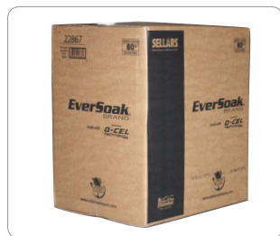
STANDARD Pads Outer Case

Caution: Not intended for use with aggressive acids or caustics. Dispose of all sorbent materials in accordance with local, state and federal regulations.